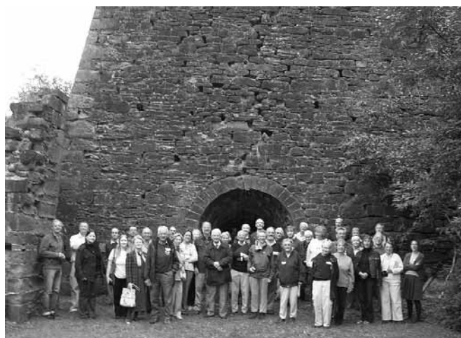
Conference delegates at the Whitecliff furnace

The Upper Redbrook valley was equally industrialised with charcoal blast furnaces, from 1604 to 1816 and copper smelting from 1690 to 1730. From 1774, a further tinplate works (on a former copper works site) operated in conjunction with the Lower Tinplate Works; also a foundry and a brewery. Kings or Quick's Mill is recorded from at least 1400 and finished life as the Wye Valley Flour Mills. A reminder of past activities were the black slag blocks, from copper smelting, used in local walls and buildings.