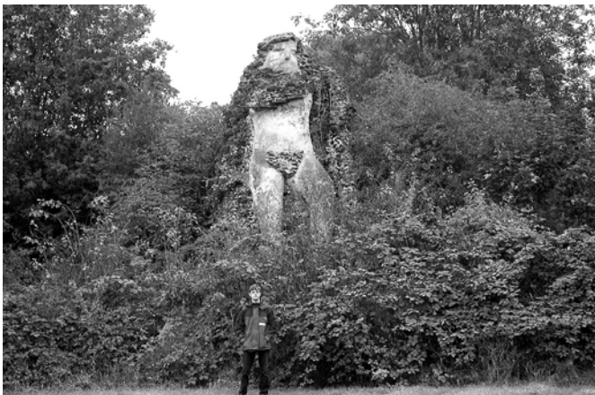
Anyone who visits Warmley should take the opportunity to see this remarkable statue of Neptune which once stood on an island in the middle of the millpond