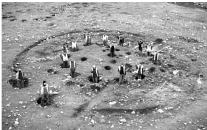
Figure 1. Members of the excavation team standing in the postholes of one of the roundhouses at Culduthel

A spectacular Iron Age settlement has been discovered at Culduthel, just south of Inverness, during work for a new housing development. The excavation by Headland Archaeology focused on a circular enclosure that was visible on aerial photographs as a cropmark. Once excavation began it was clear that the enclosure was part of a much bigger settlement which included seventeen roundhouses. All were located outside the circular enclosure and several of the buildings were exceptionally well preserved by the hillwash that sealed a large area of Iron Age archaeology.