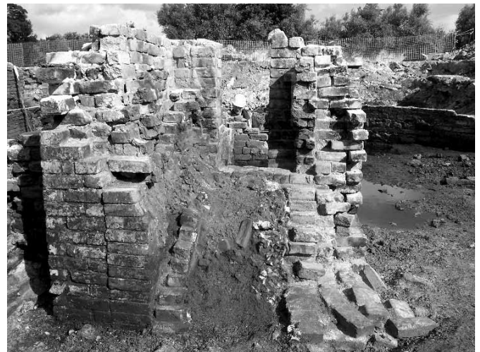
The remains of part of the puddling furnace at Swalwell

To the east of the wharf building, was a brick and sandstone structure, which measured 16.4m by 7.5m. The south-eastern wall of this structure was of similar construction to the wharf building and is likely to have originated from Crowley's Ironworks (i.e. the 18th century). The 1718 map shows a rectangular building in this location annotated as 'Half Forge' and this is also shown on a map dated 1802. The 1870 plan of the ironworks shows a similar layout to the excavated remains, with a building narrower at its northern end. Within this building were the remains of a furnace identified as the chimney end of a probable puddling furnace. The puddling furnace was patented by Henry Cort in 1783-4 and was designed to create wrought iron from pig iron produced in a blast furnace. The structural remains surviving at Swalwell comprised a main outer skin of bricks with several phases of inner brick skins that represented repairs and replacements to the structure over time.