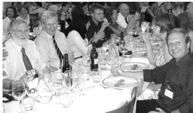
Fig 1. Delegates relaxing during the conference dinner

E. Franceschi, I. Cascone and D. Nole presented a poster about metallurgy of Liguria, a region not well known in archaeometallurgical studies, although there were found the earliest evidence of copper mining in Italy. They had studied objects coming from two different sites, one dated to 25th–20th century BC (Castellari), another to 15th century BC (Sant’Antonino di Pertis).