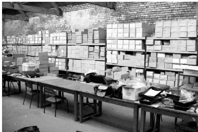
Figure 1. The National Slag Collection, housed at the Ironbridge Institute

The strengths of the NSC are currently for post-medieval ferrous metallurgy of the West Midlands and the Lake District.