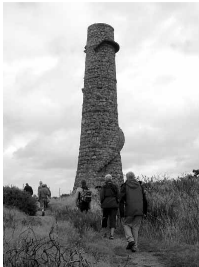
Figure 2. Chimney from a lead smelter at Ballycorus

through the 45m (150ft) vat of water. To create the vertical drop required the shot tower was located above an abandoned mine shaft, with the extra height gained by adding the tower above. The spheres once collected were sorted, polished, graded and bagged in the riddle building prior to being sold.