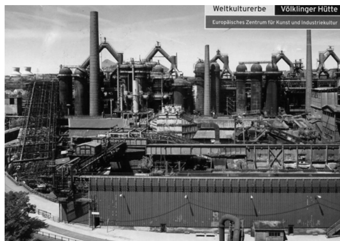
Figure 1. the World Heritage Site, Völklingen Hütte, Germany

I thought I'd be there for an hour or so, but spent the whole day wandering round the iron works, without enough time to visit the extensive museum displays on site, or the nearby mining museum. As the pictures show, it is a complex of six blast furnaces that were built in the 19th century and were continually updated until they ceased to be operational in the 1980s. The site has been preserved in its entirety so you can see the rail lines that brought in the ore and coal, the vast ore shed, the coking plant, the blowing hall, and the heat exchangers clustering round each furnace. You can also climb ladders up onto the charging platform (Figure 3) and see the monorail tubs that brought the burden up the inclined ramp and tipped it into the top of the furnaces when the bell was lifted. Down below are the tuyères (Figure 3) and the tapping floor where the molten iron was run down into the railway wagons below, and taken to a nearby steel plant. It's all well worth a visit, so do add it to your 'must see' list!