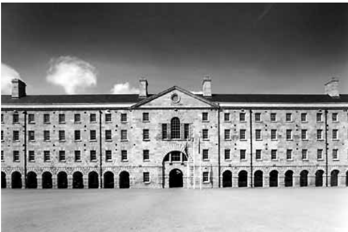
Figure 4. The National Museum at Collins Barracks, Dublin