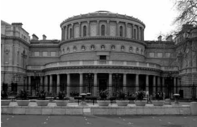
Figure 3. The National Museum in Kildare Street, Dublin

explained how the museum would like to contribute to the larger picture of metalworking in Europe. He also shared his hopes that the future will bring less emphasis on purely stylistic and typological studies and more on scientific research so that we can gain a more detailed understanding of ancient metalworking technology. After this introduction conversations continued over excellent wine, served by the extremely friendly museum staff.