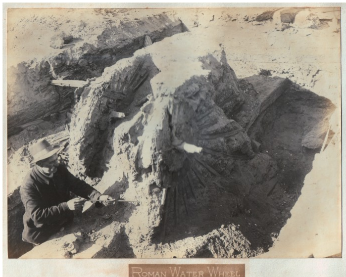
Roman waterwheel in the process of being excavated

Recovered Roman ladder flanked by Drewitt and Wyatt slag heaps, Roman adits and Roman mining tools along with images of the waterwheels during excavation. The findspot coupled with the subject matter, not least the annotations of numerous slag heaps, suggests that the photographer may have gained their metallurgical knowledge whilst working in the Sheffield industries.