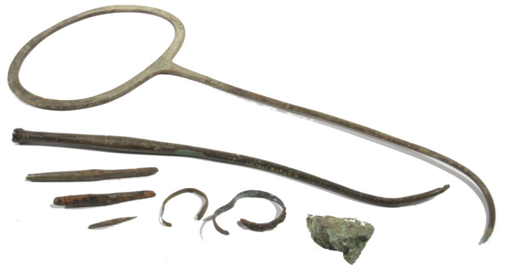
The range of metalwork recovered from Horton

A complete quoit-headed pin (c. 1400-1250 BC) was also recovered. The pin has a thin shank, shaped to a curved point at one end, and with a large ring at the other end. Most likely used to fasten a cloak or a piece of clothing, it represents an unusual find, with such items more associated with hoard deposits. Analysis has shown that the pin was formed from tin bronze (11.0% Sn) with the main impurities being 0.20%