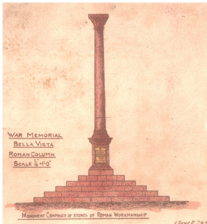
J Targett's drawing of the Bella Vista war memorial

A collection of photographs and drawings relating to the Rio Tinto mines was recently rescued from a residential skip in the Wincobank district of Sheffield. The rescuer was uncertain of the subject matter and by chance passed them on to the newsletter editor. The collection is particularly interesting and was instantly recognised as relating to the War Memorial adjacent to Rio Tinto's English Village at Bella Vista. Further inspection found that the album includes not only photographs but