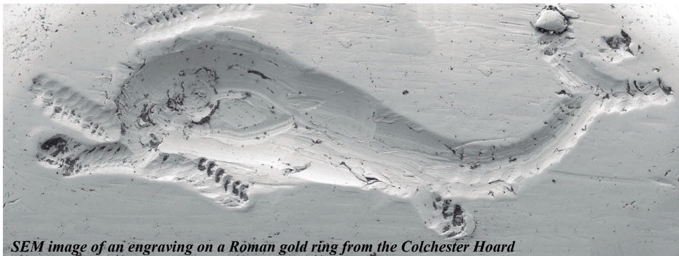
SEM image of an engraving on a Roman gold ring from the Colchester Hoard