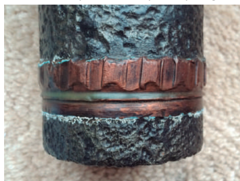
Copper drive bands.

Same applies to slag, rocks and ores. The instrument spot size is around 6mm in diameter and analytical depth a few microns so, you are only analysing a few mgs of sample.