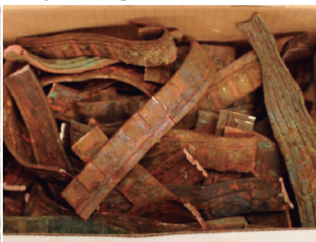
Removed from shells.