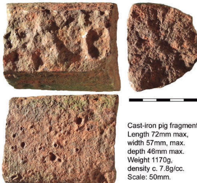
Cast-iron pig fragment. Length 72mm max, width 57mm, max. depth 46mm max. Weight 1170g, density c. 7.8g/cc. Scale: 50mm.