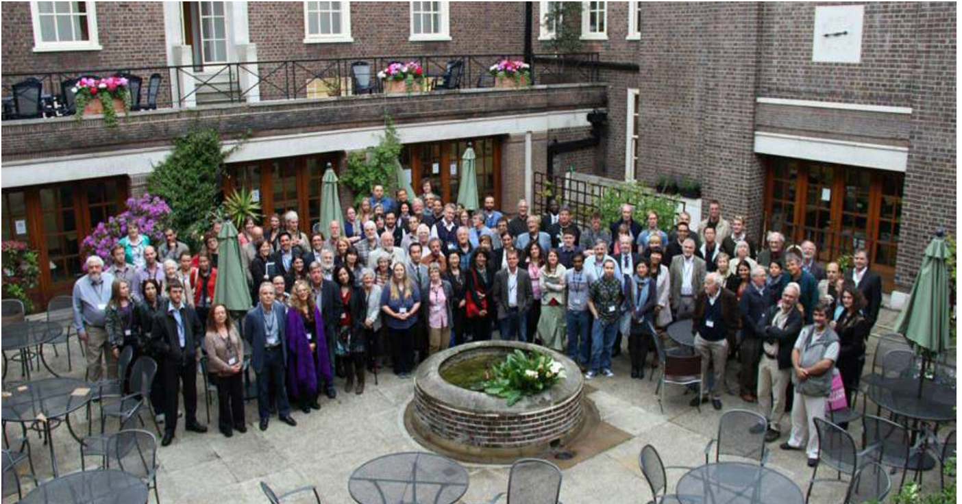
Saturday lunch time, delegates gathered in the courtyard of Friends House.