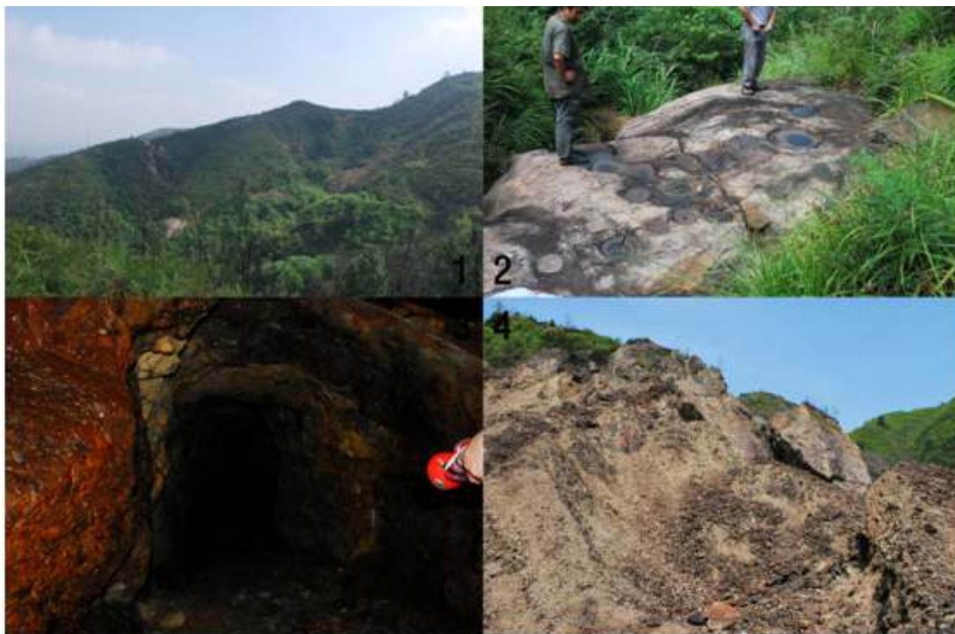
Mining remains in the site of Baojia. 1: Mining trenches, 2: Beneficiation pits, 3: Mining gallery, 4: Tailings heaps.

production systems. The team is now surveying six different gold and silver production sites in both south and north China. During last field season, a potential gold production site called Baojia in Jiangxi province, central-south China, was investigated. Large numbers of mining trenches and mining galleries were found in the area. Ancient mining work generally followed veins and left irregular galleries of variable height and width. Beneficiation remains such as shallow pits carved on rocks and tailing heaps were also frequently identified in this area. Smelting slag was found in a small plain to the west of the mining district and is now covered by modern agricultural land. Several mortar-