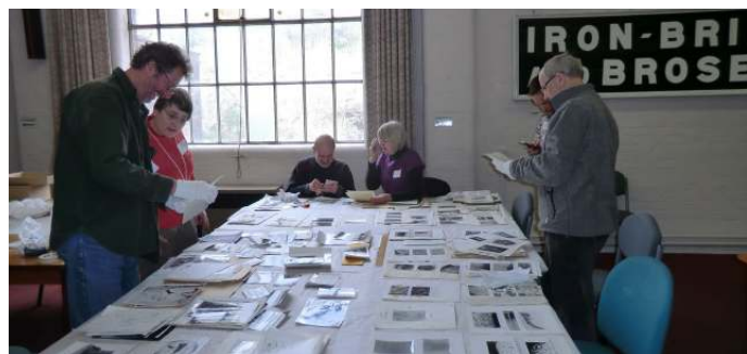
Slag day visitors and HMS members help to sort the Tylecote photography collection.

The Tylecote Collection was kept in an ad hoc selection of boxes in the Institute's stores. In the boxes were plastic bags of samples, labelled in various ways and our task was to catalogue them. The samples were re-bagged in numbered bags which corresponded with new archival boxes and the information was entered up by David Dungworth on a database as we progressed. Deciphering some of the labels in, shall we say 'distinctive' handwriting on damaged labels was a challenge, but again, the 'old hands' were often able to come to the rescue, recognising a vital clue and recalling a past expedition.