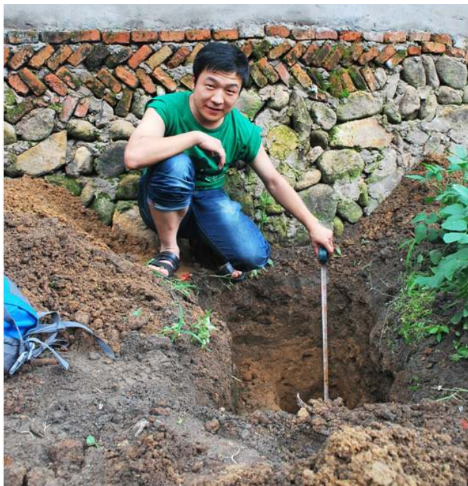
A local villager is helping us measuring the depth of a slag deposit. Charcoal samples were collected from the wall of this testing pit.

Geological ores were sampled in several ancient mines and analyzed in the laboratory. The sulphidic primary ores are rich in galena, arsenopyrite, sphalerite and pyrite. Galena was interestingly found to be argentiferous and the main silver bearing phase is tetrahedrite, which exists as small inclusions in the galena. The oxidic secondary ores are composed mainly of haematite and quartz. Small metallic prills were identified in this type of ore and microscopic analysis shows that they are electrum (gold-silver alloy) with approximately 35% gold and 65% silver.