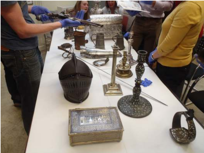
V&A handling session in the Metalwork, Silver and Jewellery Department.