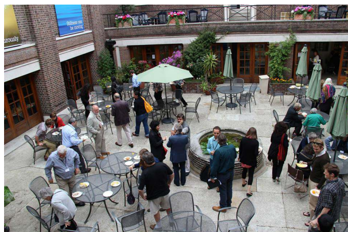
Delegates getting lunch at Friends House.