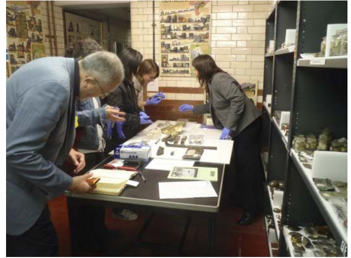
Examining selected objects from the Percy collection.