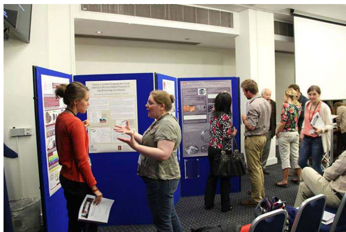
Some delegates during the poster session.