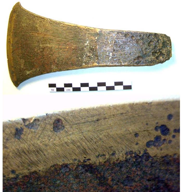
Dinolite microscope image of axe use-wear.

Other participants presented papers that detailed a number of new kinds of 3D microscopes and case studies that used blind testing to establish how effective the new microscopes might be (Evans, MacDonald, Bellow and Ollé; Stemp, Coffey, Evans, Lerner and MacDonald). These paper highlighted the strength of some new microscopes for use-wear on lithics but also the importance of rigorous blind testing, something that has yet to be implemented in copper alloy use-wear. There was much to learn about how best to carry out blind testing and the potentials and pitfalls of 3D microscopes. Another paper considered the use of GIS to map more accurately the distribution and amount of edge damage on lithics (Lerner). At present use-wear analysis on copper alloys relies on qualitative discussions of edge damage, the application of a GIS method has the potential to make use-wear on copper alloys more quantitative and scientific. Other papers were more problem-orientated, for example, one paper considered how one could use the