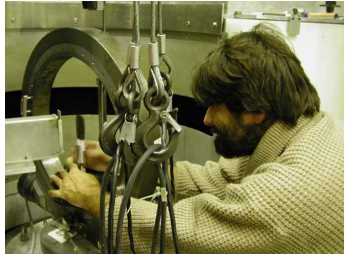
Experimenting with Aeneolithic copper axes and neutrons with a D20 diffractometer at Grenoble.

GILBERTO ARTIOLI: My only advice is to try to keep their enthusiasm along the way. They invariably approach archaeological science and archaeometallurgy because they are fascinating and challenging. Unfortunately in a time of shrinking budgets everybody gets frustrated by