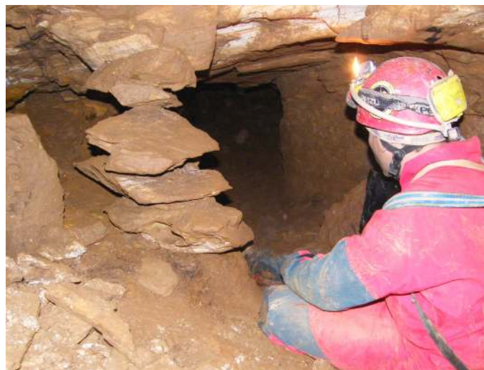
View from the inner part of Asimotrypa AS_3a mine.

Slags from the fourteen smelting sites were studied in comparison with the adjacent ore deposits. The samples from the ore deposits and the metallurgical sites were also isotopically analyzed. In the "Valtuda" metallurgical area the preliminary results imply multi-temporal gold and silver exploitation with secondary extraction of copper. The site is dated to the Roman period from the pottery finds.