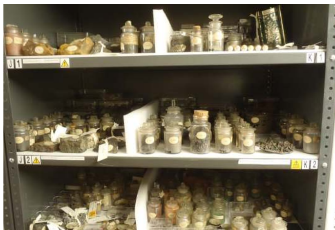
Hundreds of jars of samples in the Percy collection.

a large bar of steel made in the Bessemer-Mushet process which had undergone shear strength testing. From the separate Park Collection, was a bar of some of the earliest made aluminium created by Faraday in the early 19 th century. However, some of the most surprising objects were much older. There was a collection of ancient metal artefacts that had been sent to Percy for analysis; this included samples cut from a silver cup from excavations at Nineveh and a large sample taken from a bronze sword from Mycenaean Greece. This really shows that Percy was not just a metallurgist, but also one of the early pioneers of archaeometallurgy.