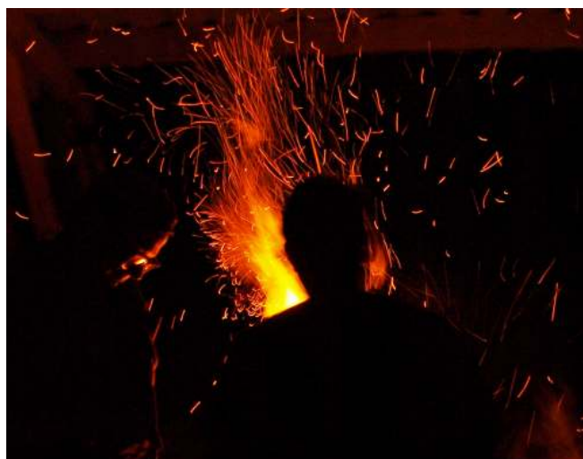
'Accidental and Experimental Archaeometallurgy'. HMS Occasional Publication No 7, to be released 2013.

Accidental and Experimental Archaeometallurgy is available from Brian Read, 22 Windley Crescent, Darley Abbey, Derby, DE22 1BZ, United Kingdom at a cost of £13 + £2 UK postage (£5 postage outside the UK). Email: brian.read2@ntlworld.com .