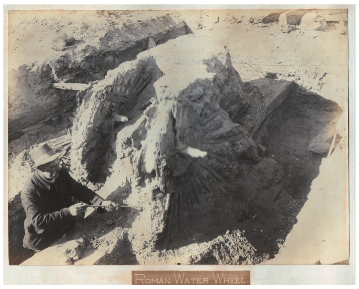
Roman waterwheel in the process of being excavated

slag heaps, Roman adits and Roman mining tools along with images of the waterwheels during excavation. The findspot coupled with the subject matter, not least the annotations of numerous slag heaps, suggests that the photographer may have gained their metallurgical knowledge whilst working in the Sheffield industries.