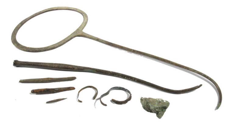
The range of metalwork recovered from Horton

A complete quoit-headed pin (c. 1400-1250 BC) was also recovered. The pin has a thin shank, shaped to a curved point at one end, and with a large ring at the other end. Most likely used to fasten a cloak or a piece of clothing, it represents an unusual find, with such items more associated with hoard deposits. Analysis has shown that the pin was formed from tin bronze (11.0% Sn) with the main impurities being 0.20%